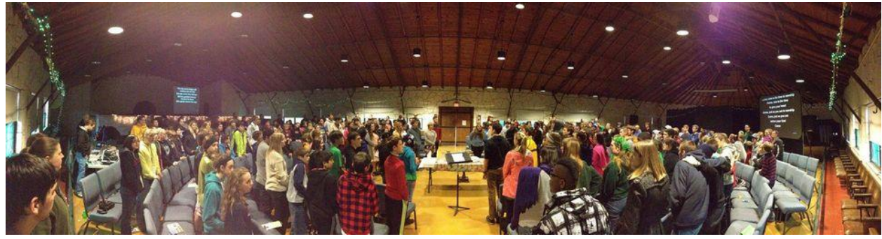
Midwinters at MO-Ranch

The Stewardship & Fiscal Oversight Committee (SFOC) presents, in addition to the usual line-item budget, this narrative budget to show more graphically where Mission Presbytery's money comes from in broad categories and where the money goes using the four categories of the mission statement above. We hope this will allow for a better understanding of the presbytery's finances and will encourage increased generosity by our congregations so that we are best able to finance the mission of the presbytery.