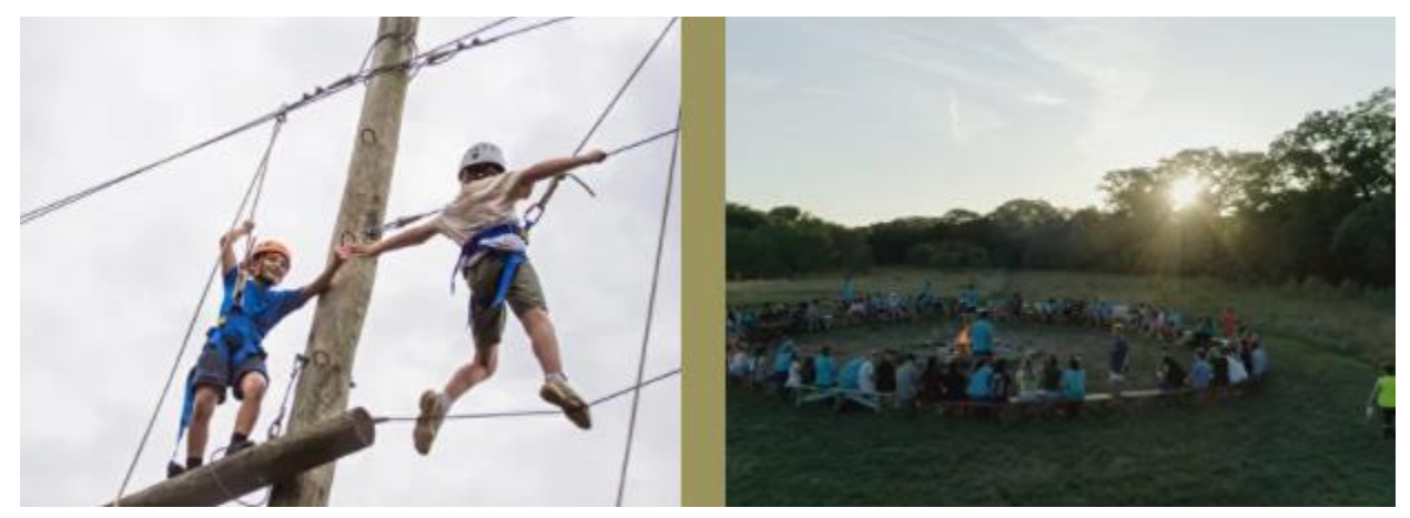
John Knox Ranch.....lifechanging experiences for young people with God and others

3. Enable mission and witness to the gospel that congregations cannot accomplish alone (includes $851,475.58 or 60% of expenses). This includes the committees for Mission Outreach and Justice, Presbyterian Disaster Assistance, Youth Connections, along with Presbyterian Women and John Knox Ranch.