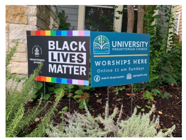
University PC, Austin with a vibrant campus ministry

2. Recruit, receive, ordain, develop, and care for those called to service in the church (includes $185,449.71 or 13% of expenses). This includes the Committees on Preparation for Ministry, Representation and Participation, Pastoral Care, and the Permanent Judicial Commission