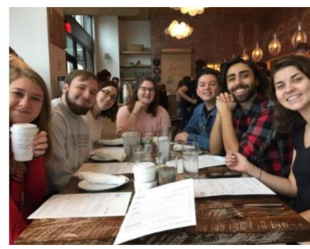
Pictures of Student Ministry at Texas State U., supported by Mission Presbytery