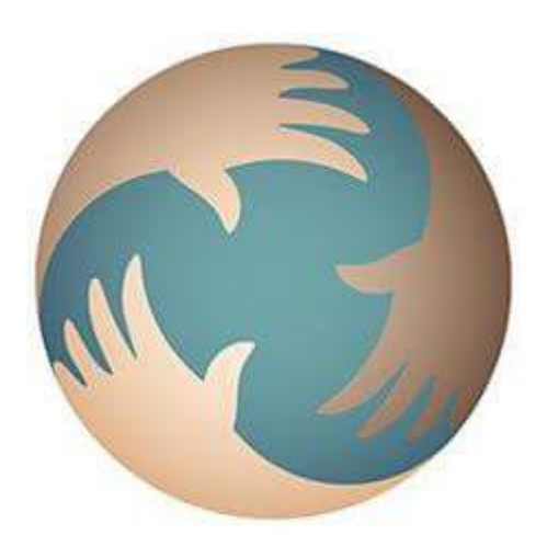
Presbyterians for Just Immigration